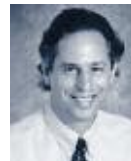
James J. Corbett